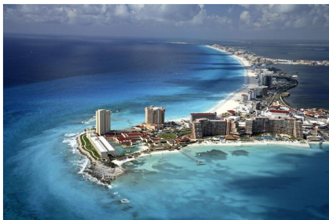
Cancun panoramic view