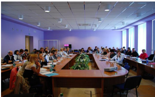
“Risk Management and Regulatory inspections” course attendees