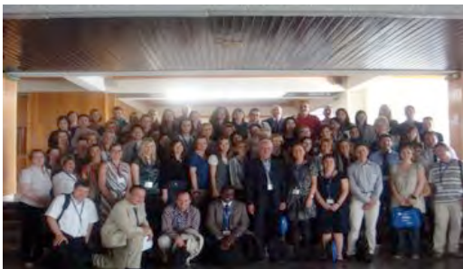
Training courses participants

ISoP offered bursaries to 3 young researchers from emerging countries and students to support their attendance at the training courses in Belgrade; here are some extracts from their reports: