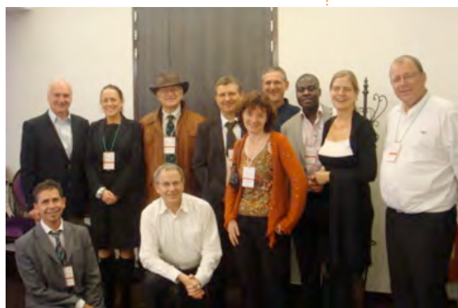
The new ISoP Executive Committee (2009-2012)